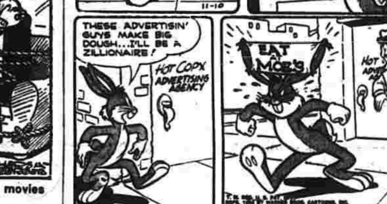
(Written by the Staff Writers)