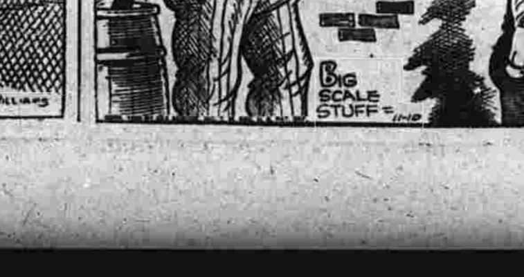
(Written by the Staff Writers)