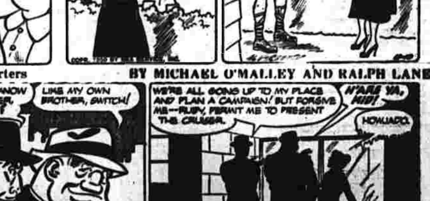
(Written by the Staff Writers)