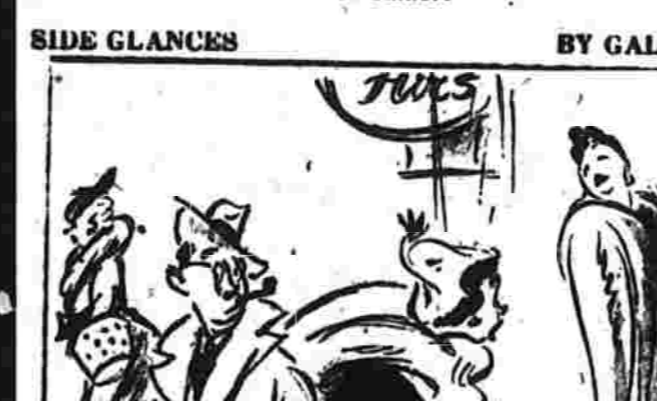
(Written by the Staff Writers)