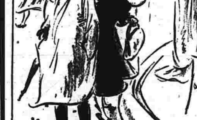
(Written by the Staff Writers)