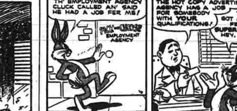
(Written by the Staff Writers)