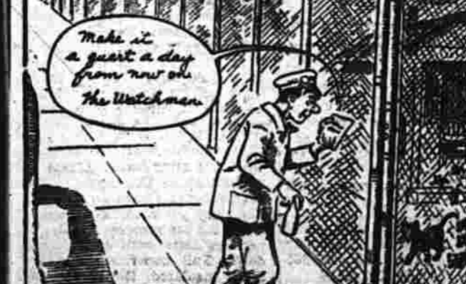
(Written by the Staff Writers)