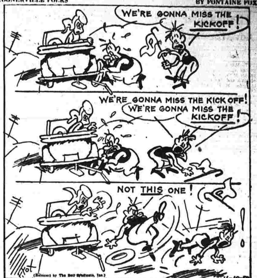
(Written by the Staff Writers)