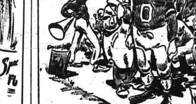
(Written by the Staff Writers)