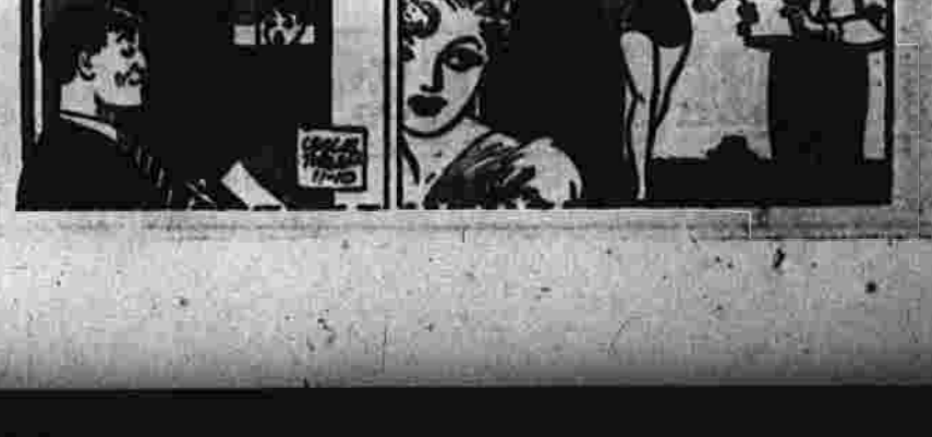
(Written by the Staff Writers)