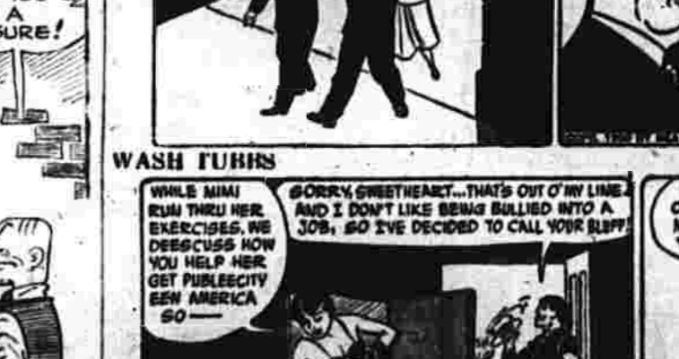
(Written by the Staff Writers)