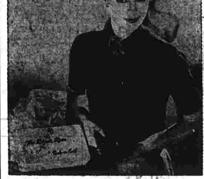
THE BLACK ROSE Sweater* by Tish-u-Knit—dramatic, yet demure—its trim ribbed collar, smart up or down...