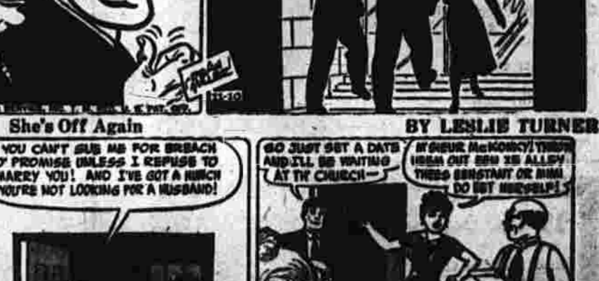
(Written by the Staff Writers)