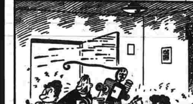
(Written by the Staff Writers)