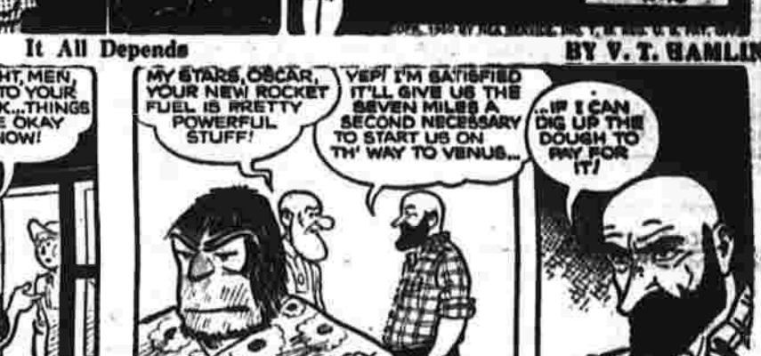
(Written by the Staff Writers)