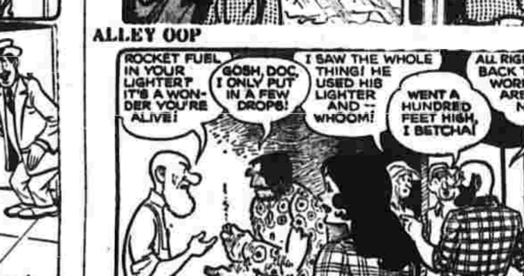
(Written by the Staff Writers)