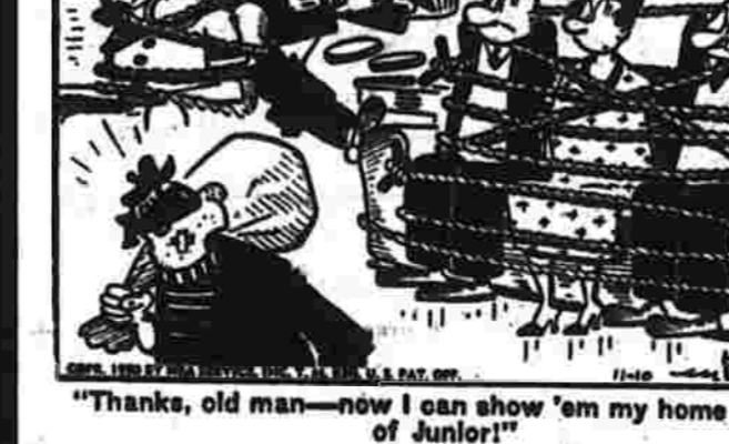
(Written by the Staff Writers)