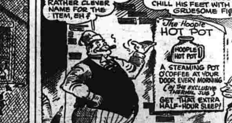
(Written by the Staff Writers)