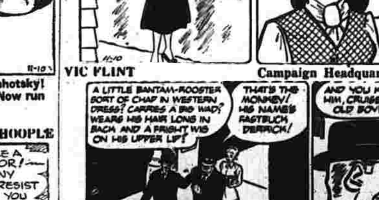
(Written by the Staff Writers)