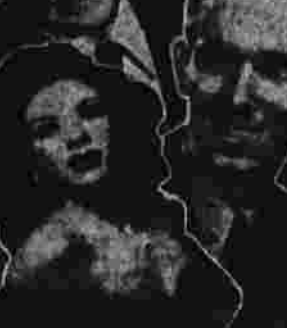
Bob Crosby, Jerry Gray and the Club 15 Orchestra.