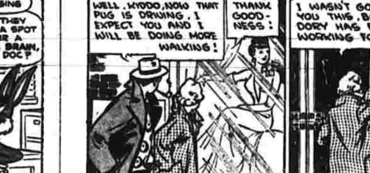
(Written by the Staff Writers)